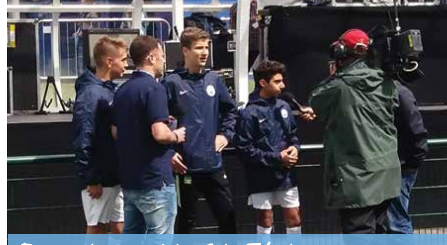
Being interviewed by City TV at Cityzens Weekend