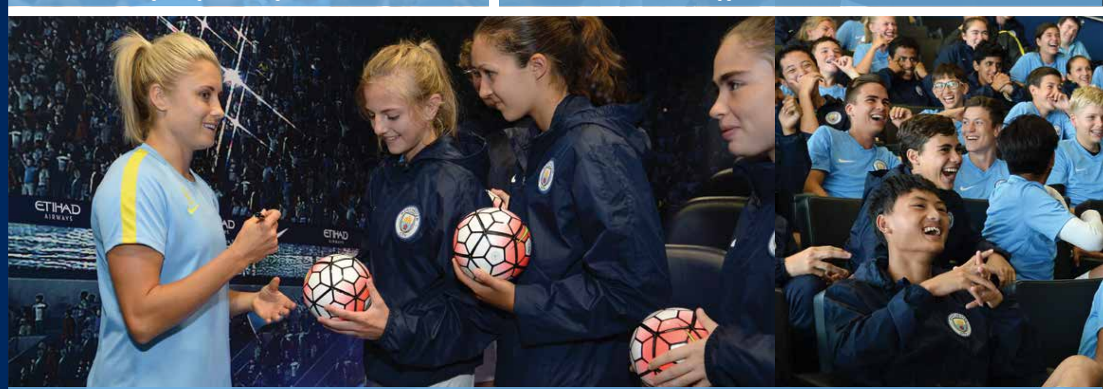
Man City Women and England Captain Steph Houghton signing footballs for the girls after a QEA session