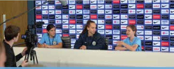
Practising interview skills in the Media Centre at City Football Academy HQ

As the Women's game continues to grow and evolve, we look forward to seeing girls from all over the world come to City Football Academy to experience what it's like to train like a City player."