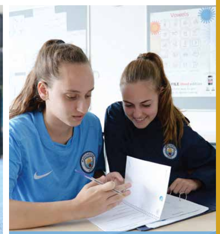
Learning about tactical language in Football Plus sessions