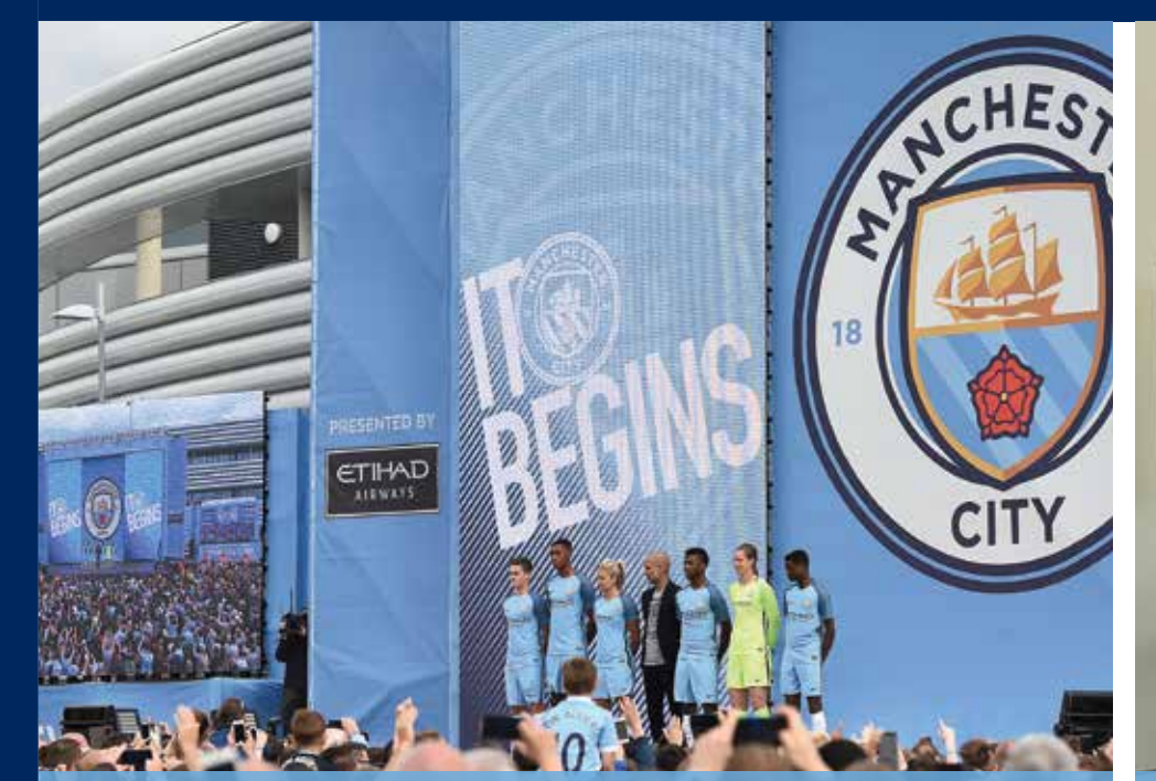
Watching Pep Guardiola and players launch the new Manchester City badge at Cityzens Weekend