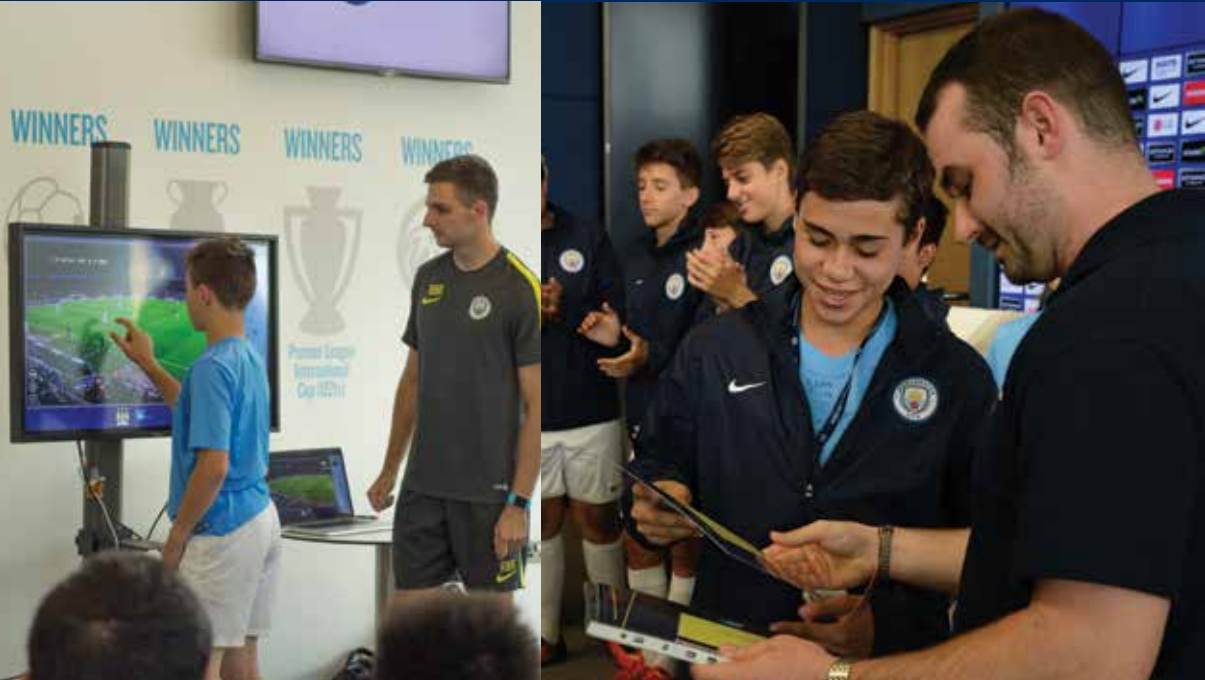
Learning about match tactics with touch-screen technology